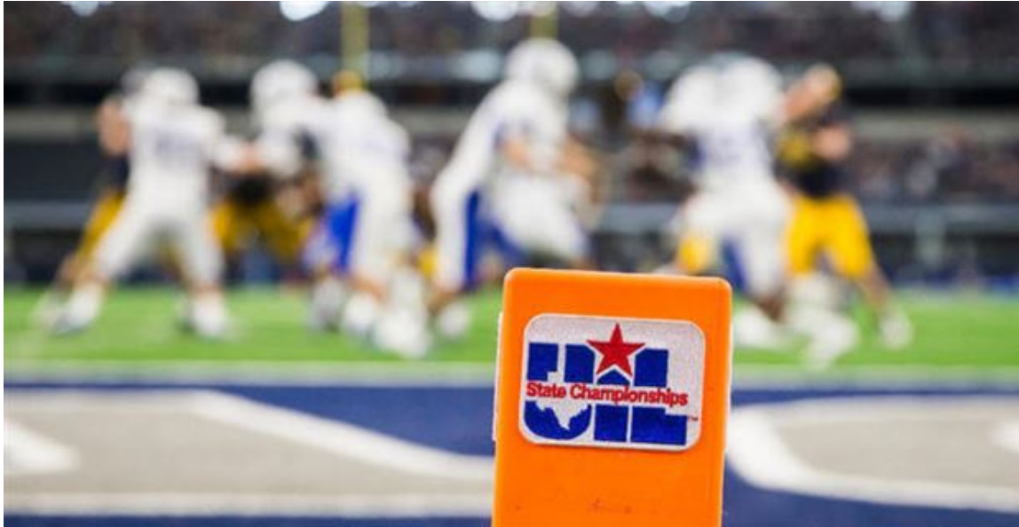
Instant Replay is making its way into Texas HS Football.

News broke Thursday morning from the University Interscholastic League that it will use instant replay at Football State Championship games beginning in 2018.